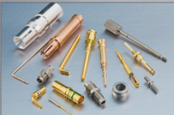
Contacts and Sub-Assemblies

CNC precision machining made to your blueprint, featuring primary, secondary, and complete engineering support. Capabilities include: crimping, plating, slotting, knurling, assembling, threading, heat treating, and zone annealing. Short to medium runs with quick turnaround are our specialty.