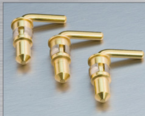
Right Angle Contacts