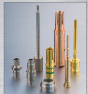
Contacts and Bodies